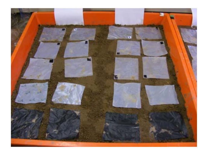
Fig. 1: Bioplastic strips are placed on the soil surface in plastic griddle.

For the filed experiments, a heat paste machine "Polystar 100 G" (Fig. 2) was used to produce the lateral prototypes from the biomaterials with 0.2 m long and 20 mm diameter.