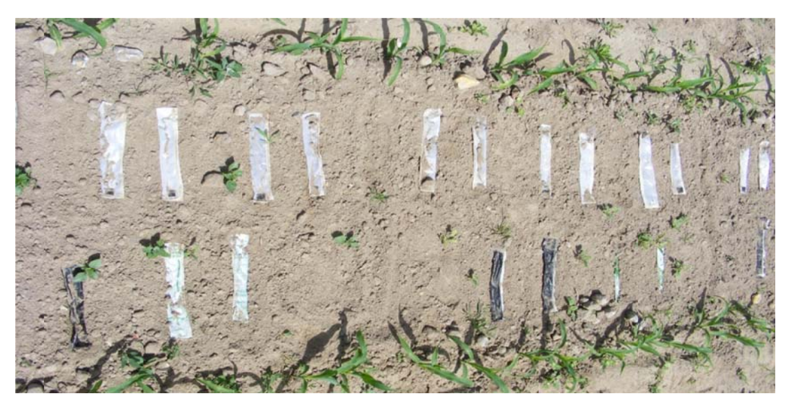
Fig. 3: Bioplastic tubes at the field