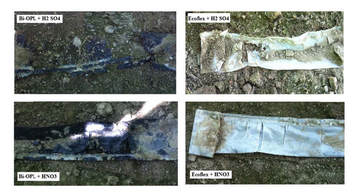
Fig. 5: The bioplastics degradation after the exposure time at field

The results obtained in this study have indicated that both Bi-OPL and Ecoflex samples have the similar degradation rate at various acids levels (Sulphuric and nitric acids) and times (Fig. 5). They degrade significantly faster in a high acidic than in low concentration. Overall, the three Ecovio bioplastics studied exhibit slow to moderate degradability in acidic conditions. However, Bi-OPL and Ecoflex reveal higher degradability in the high acidic conditions.